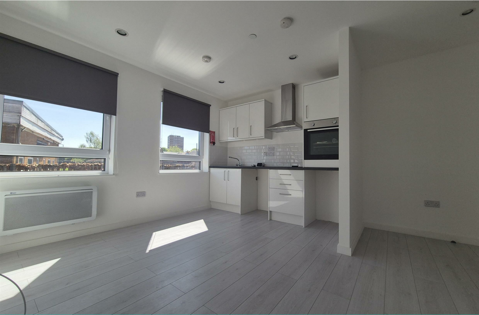
Flat 3 Priest House, Old Hill, B64 6JN